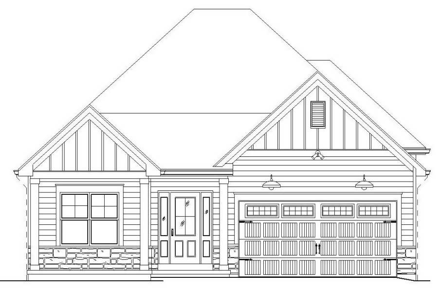
948 Twin Pine Drive` Des Peres, 63131